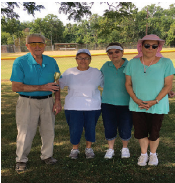
TUESDAY AM WINNERS: TEAM 6