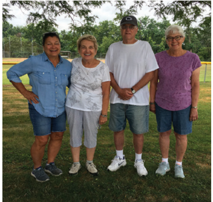
MONDAY AM WINNERS: TEAM 4

A fall league will begin on Monday, September 12 at 9:00 a.m. and end on October 17 (every Monday for six weeks). If you are interested in giving bocce a try, you can sign up as an individual or as a team (four persons). Bocce is easy to learn, so come out and give it a try. Call Louise Morgan at 717-944-6518 if you are interested.