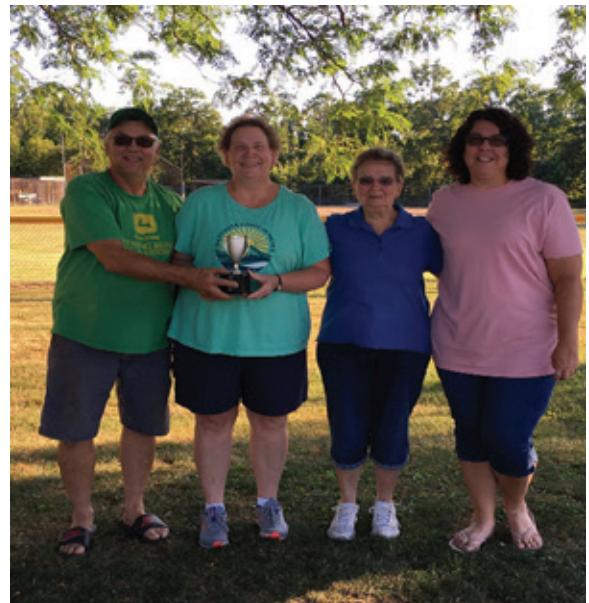
TUESDAY PM WINNERS: TEAM 9